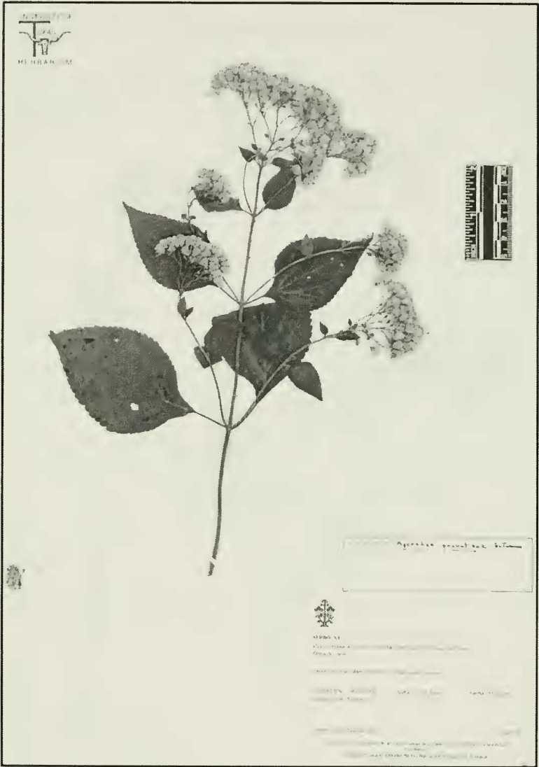
Fig. 2. Holotype of Ageratina pochutlana .